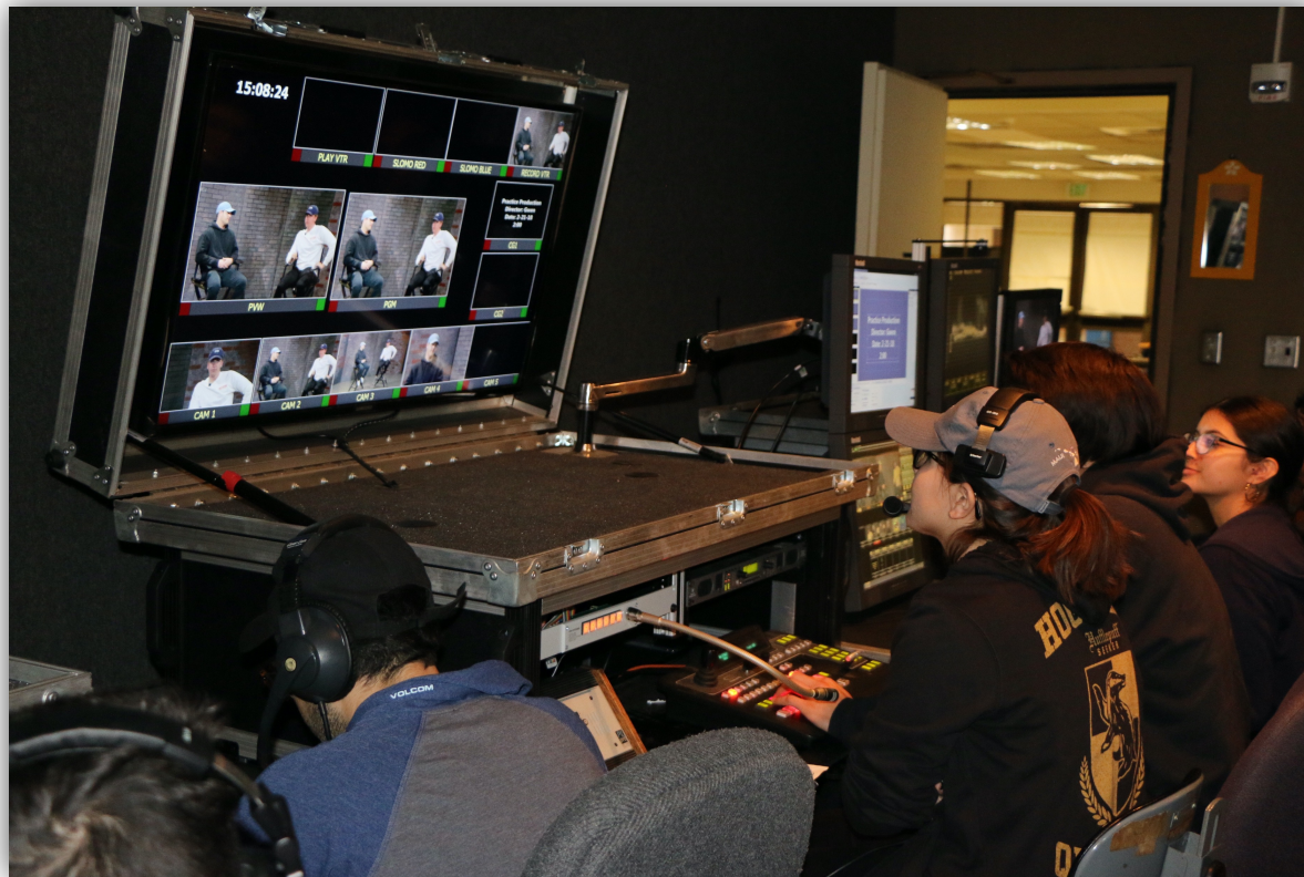
Television Studio Production students working in the control room.