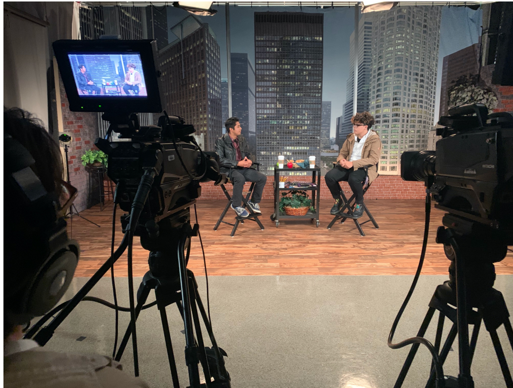
Television Studio Production students producing the talk show, The Buzz .