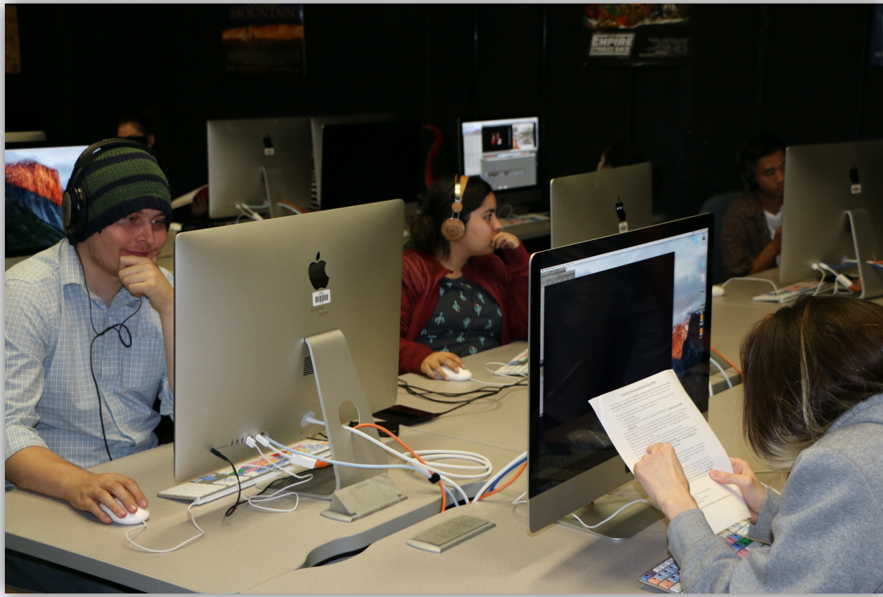
Students at work in the editing lab.