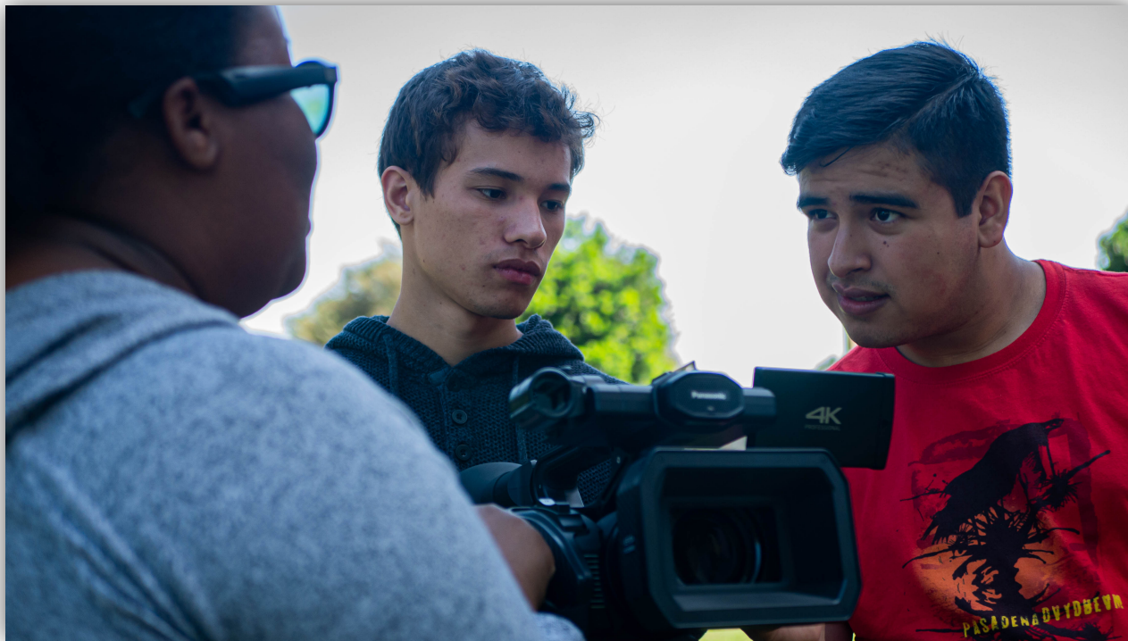
Digital Production students discuss the next shot.