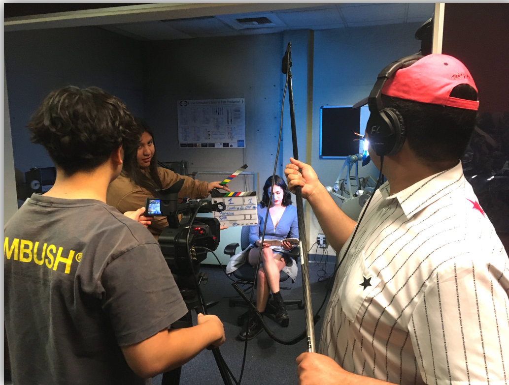
Advanced Digital Production students set up a shot.