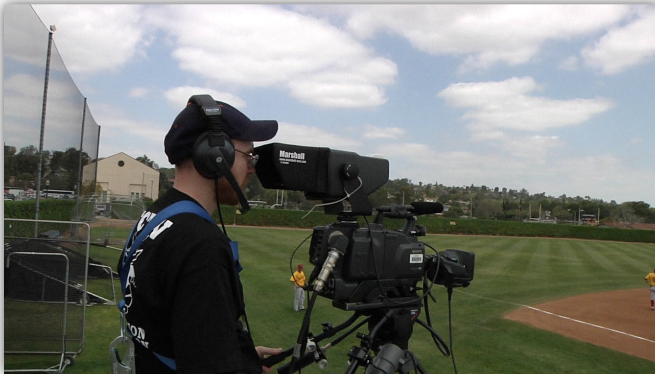
CRTV 280 Television Production Workshop camera operator covers a live game.